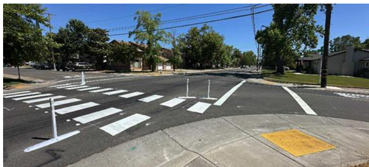
Recent Tahoe Park quick-build intersection improvement.

Change is hard and not everyone thinks that changing our streets for everyone is good for them. In this case, new quick-builds , which we know will slow down traffic is getting push back. Slow Down Sacramento is asking you to email city leaders and traffic engineers to let them know that you are in favor of these types of temporary redesigns in your neighborhood.